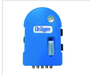
Dräger PAS® Filter – portable