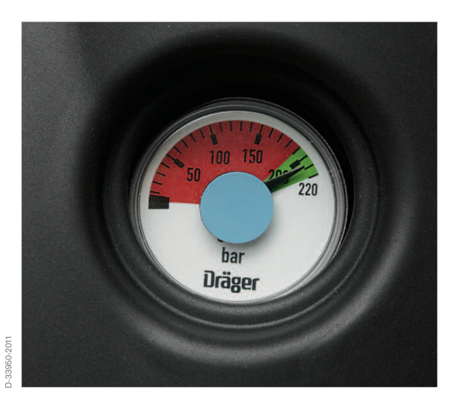
Check contents gauge ensuring the cylinder is fully pressurised (i.e. 200 bar). The gauge needle must be inside the green segment of the gauge face.