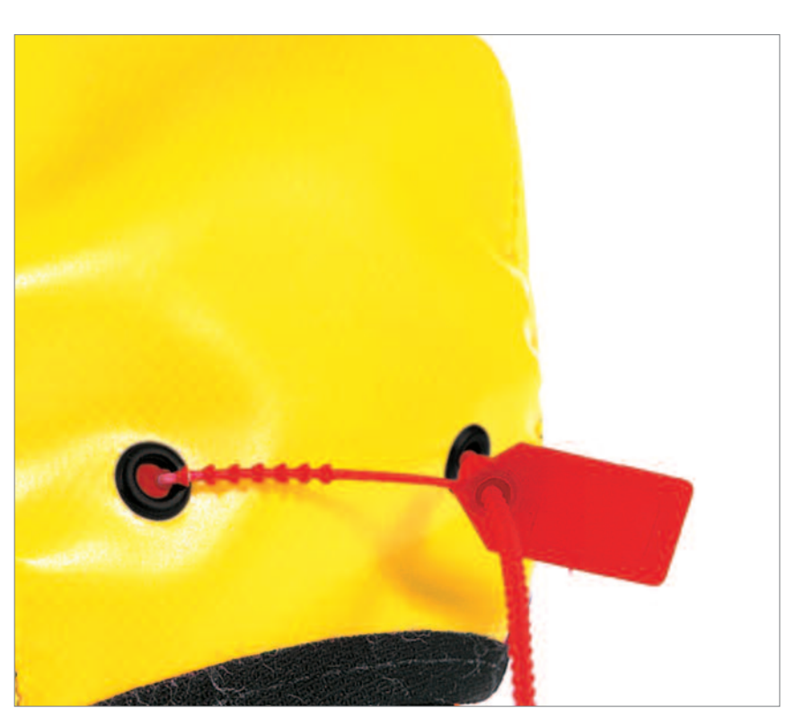
An intact anti-tamper device ensures full performance. If this device is broken the unit must be checked.