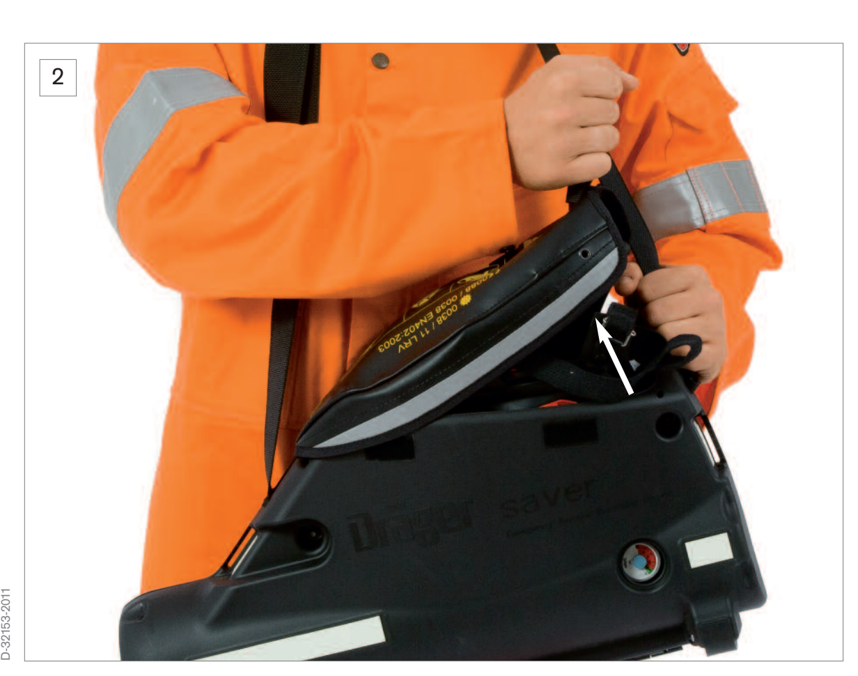
Grip the loop on the lid of the carrying case and pull firmly upward to break the anti-tamper tag. Open the flap of the case which then releases the locking clip from the valve turning on the air supply to the full-face mask.