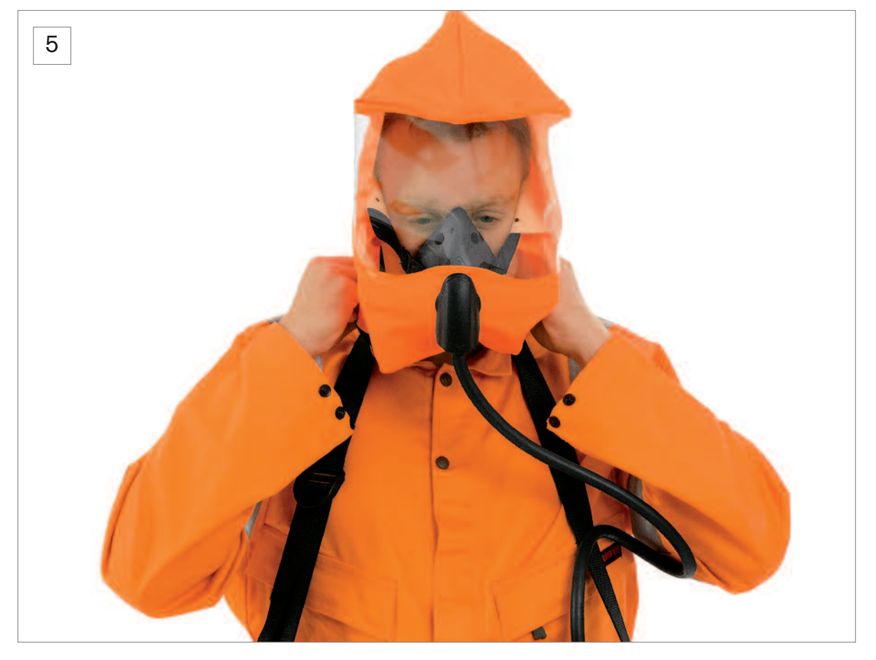
Position half mask over nose and mouth and breath normally.