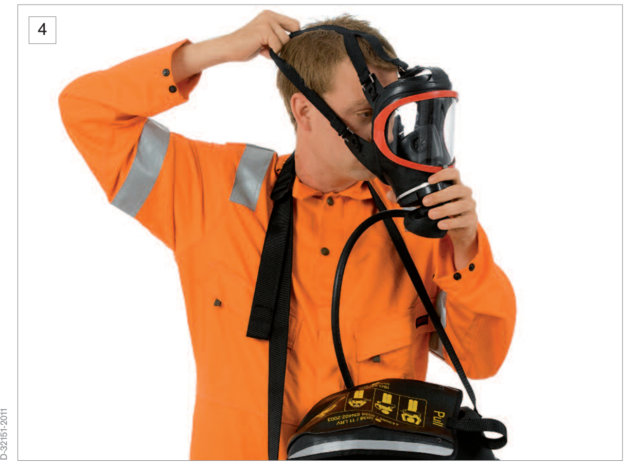
Donning the full-face mask: Using one hand, hold the mask onto the face and with the other hand, pull the elastic head harness over the back of head, locating the harness centrally with the back of the head.