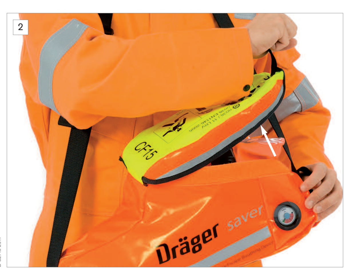
Grip the loop on the lid of the carrying bag and pull firmly upward to break the anti-tamper tag. Open the flap of the bag which then releases the locking clip from the valve turning on the air supply to the hood.