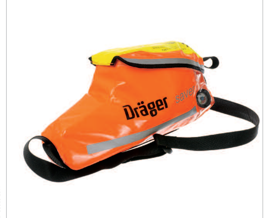
Dräger Saver CF Soft Bag