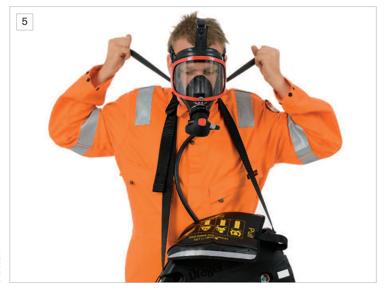
Tighten both lower straps evenly towards back of the head.