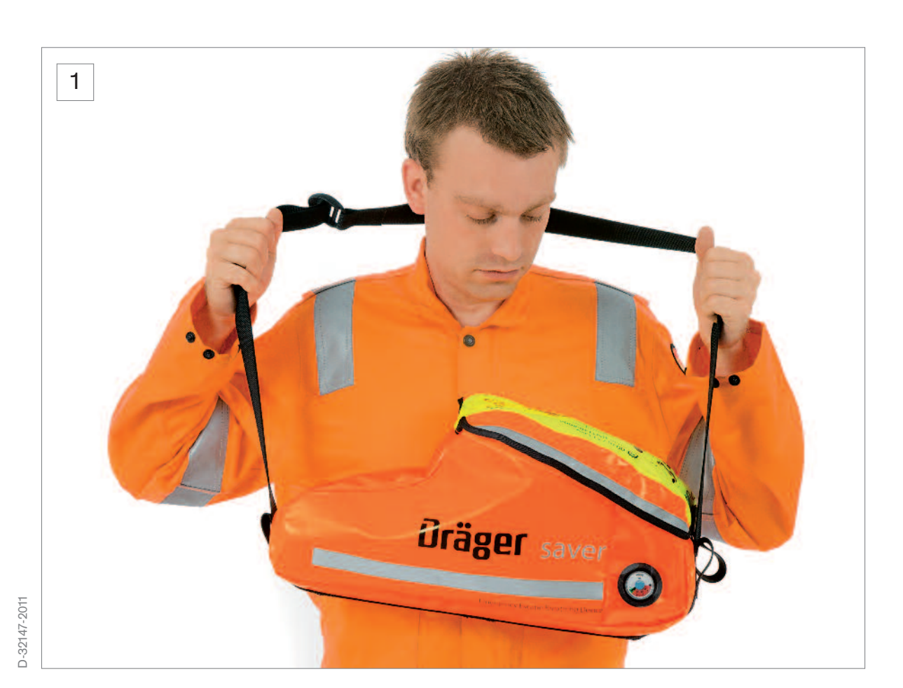
Place neck strap of carrying bag over head. Adjust length of strap until equipment sits in the centre of chest. Fix waistbelt, if fitted, and adjust by pulling the free end until equipment is secure and comfortable.