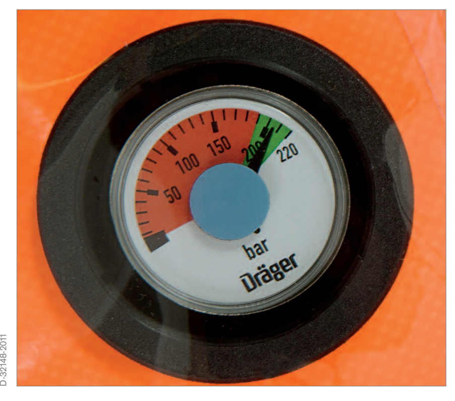
Check contents gauge ensuring the cylinder is fully pressurised (i.e. 200 bar). The gauge needle must be inside the green segment of the gauge face.