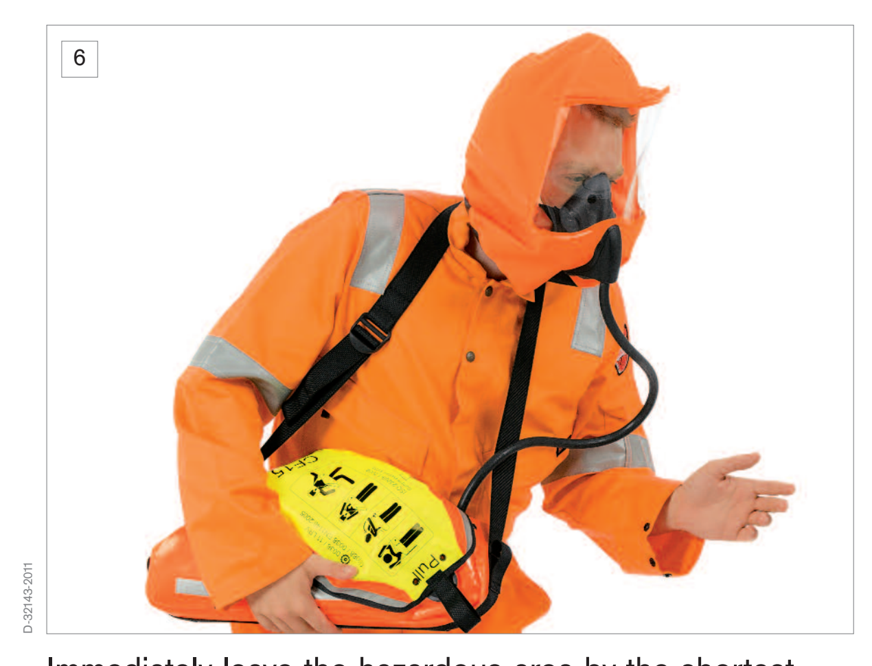
Immediately leave the hazardous area by the shortest and safest route.