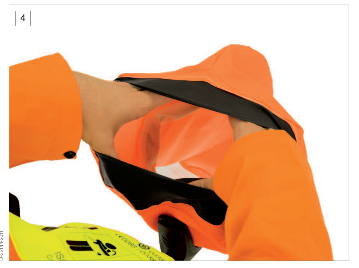
Place both hands inside the hood neck seal, place chin inside half mask and pull hood over head from front to back.