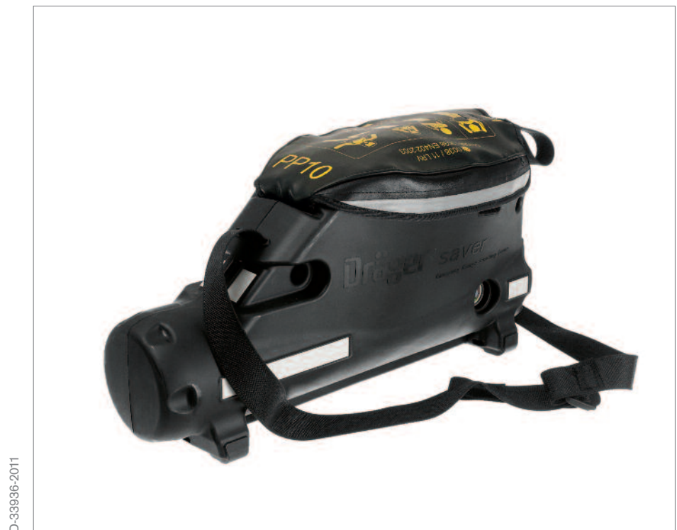
Dräger Saver PP Hard Case