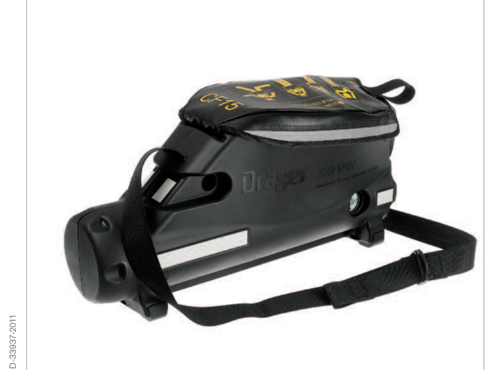
Dräger Saver CF Hard Case