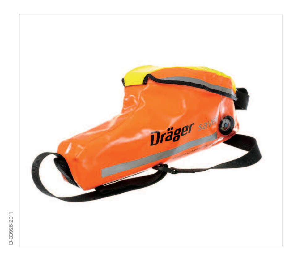
Dräger Saver PP Soft Bag