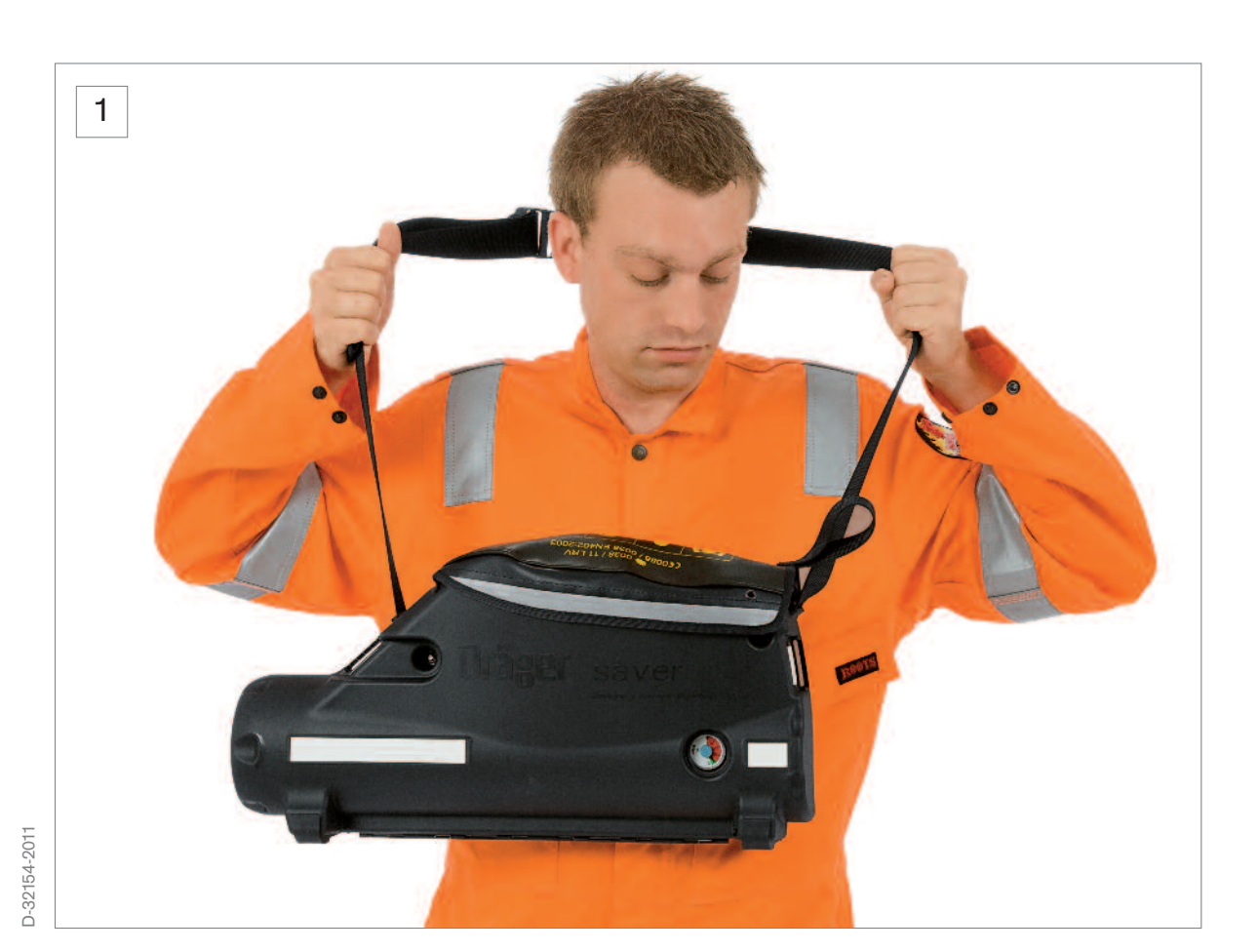
Place neck strap of carrying case over head. Adjust length of strap until equipment sits in the centre of chest. Fix waistbelt, if fitted, and adjust by pulling the free end until equipment is secure and comfortable.