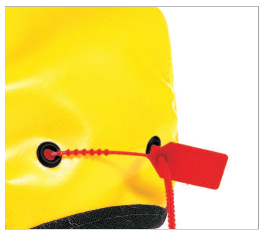
An intact anti-tamper device ensures full performance. If this device is broken the unit must be checked.