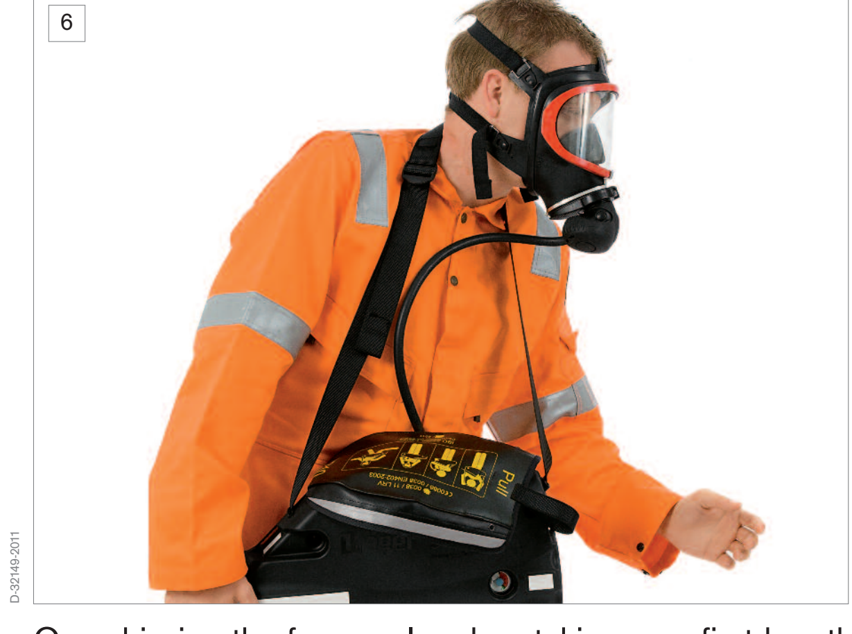
On achieving the face seal and on taking your first breath of inhalation the lung demand valve will automatically switch to positive pressure starting air supply to mask. Breathe normally and immediately leave the hazardous area by shortest and safest escape route. Safety Warning: Do not remove the equipment until in a safe area and clear of hazard.